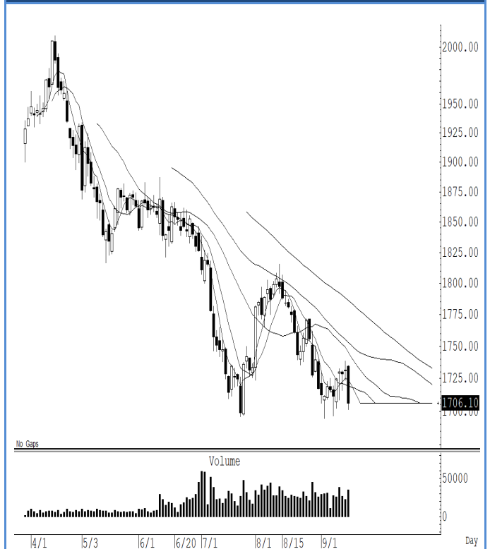
GOU22 (Close 1,706.01 Chg -24.90)

ราคาทองคำโลกปรับตัวลงมาใกล้จุดต่ำเดิม สั้น ๆ ตีกลับไม่ผ่าน 1,715 ดอลลาร์ แนวโน้มน่าจะทำจุดต่ำใหม่ แนะนำ trading ในกรอบระหว่าง 1,715-1,640 ดอลลาร์ ระวังกำไร หรือในกรณีที่ปิดต่ำกว่าระดับ 1,640 ดอลลาร์ แนะนำ ถือ short หวังผลปรับตัวลงไปแถว ๆ 1,520 ดอลลาร์ ระวังกำไร